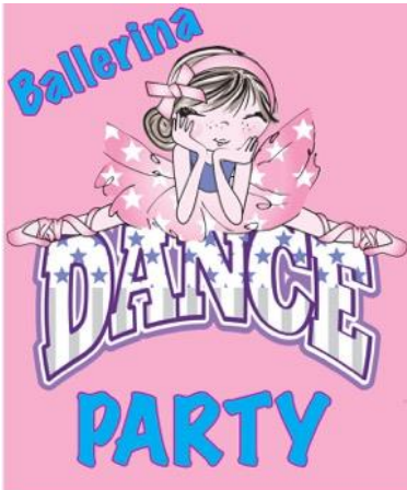
Ballerina B-Day Party