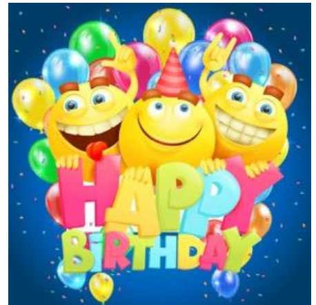
Emoji B-Day Party