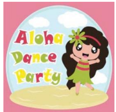
Hawaiian Beach B-Day Party