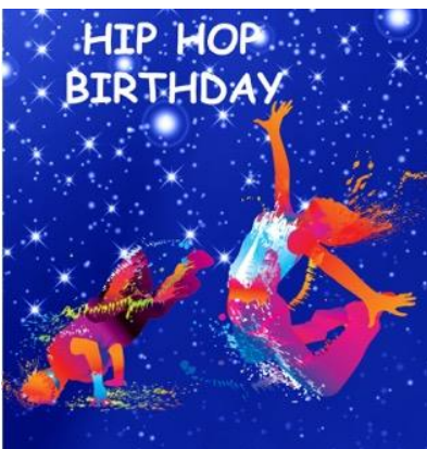
Hip Hop B-Day Party