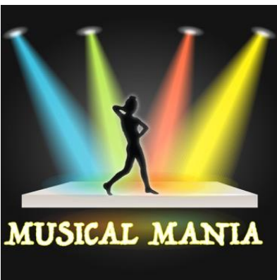
Musical Mania B-Day Party