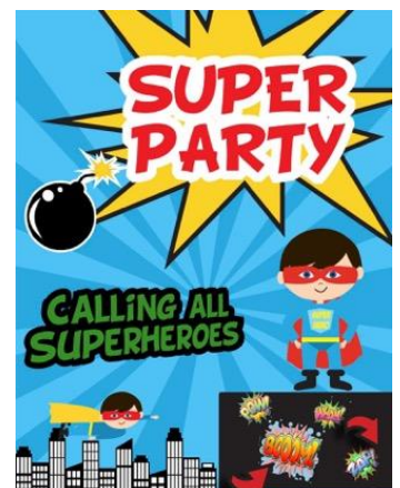
Super Hero B-Day Party